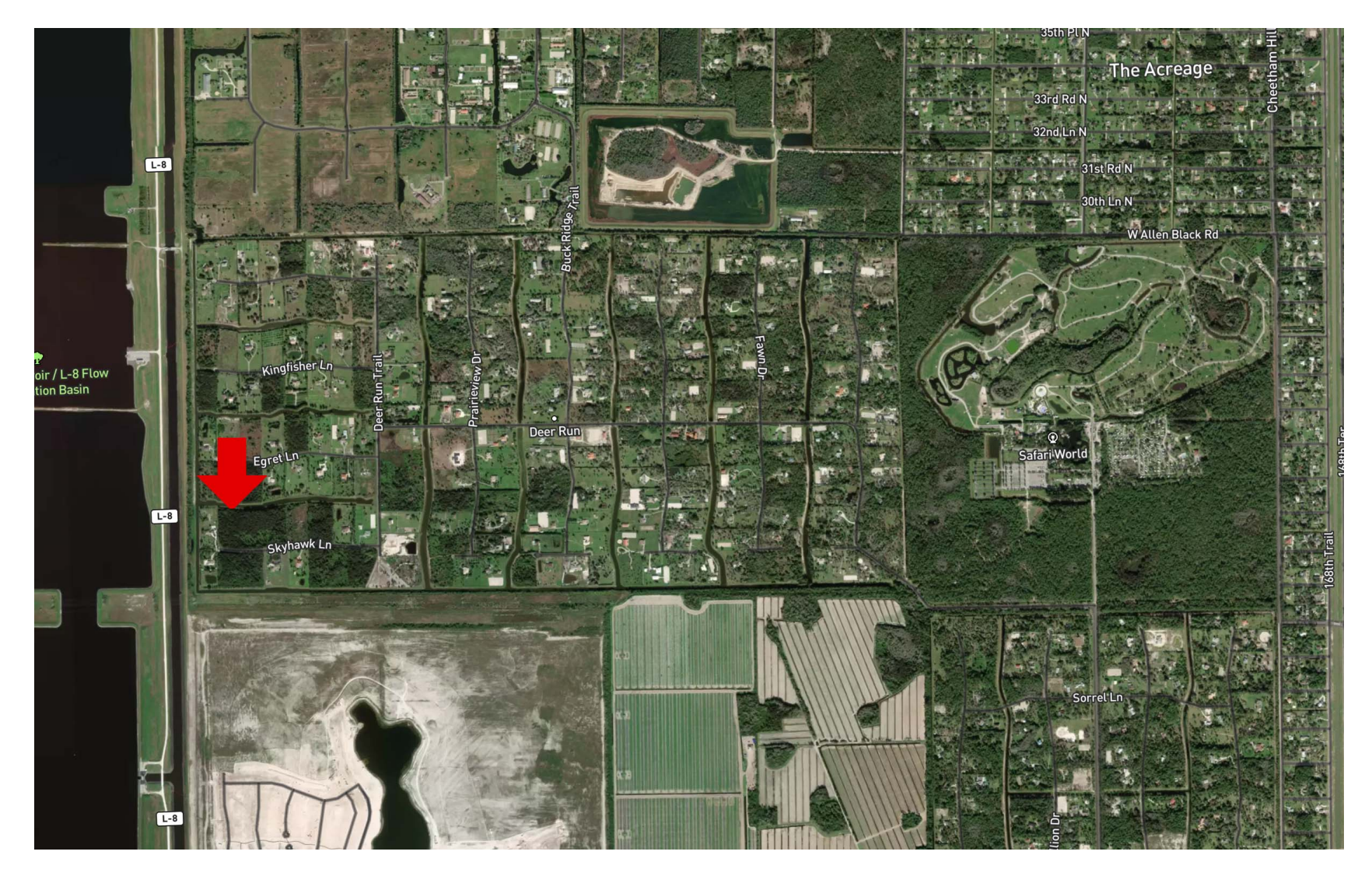
Disclaimer: Sizes and Dimensions are Approximate, Actual May Vary.