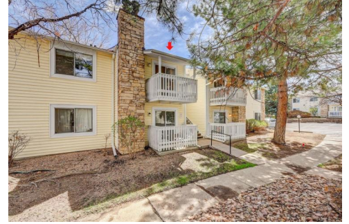
8555 Fairmount Drive, Unit B207, Denver, CO 80247 - Main Level