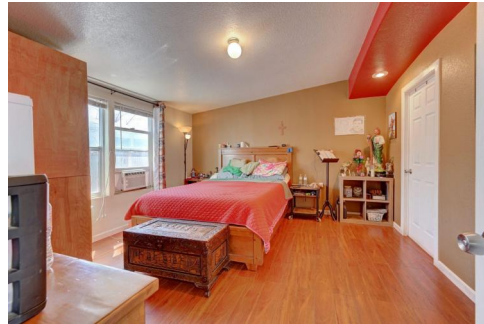
8433 Jackson Way, Thornton, CO 80229 - Main Level