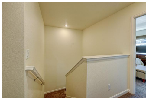
23648 East Ida Drive, Unit #C, Aurora, CO 80016 - All Levels