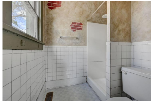
3235 Pecos St - #3233, Denver, CO 80211 - Main Level