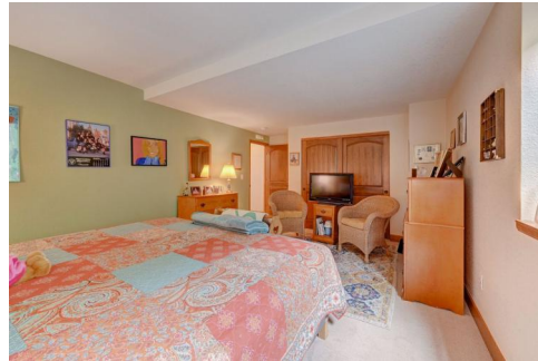
7168 West Jewell Drive, Lakewood, CO 80232 - Basement