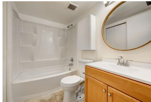
902 South Walden Street, 101, Aurora, CO 80017 - Main Level