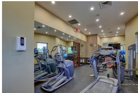
16275 Collins Avenue, 701, Sunny Isles Beach, FL 33160 - 2-16275-collins-avenue-sunny-isles-b