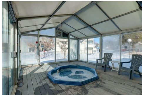
1326 South Danube Way, #106, Aurora, CO 80017 - All Floors